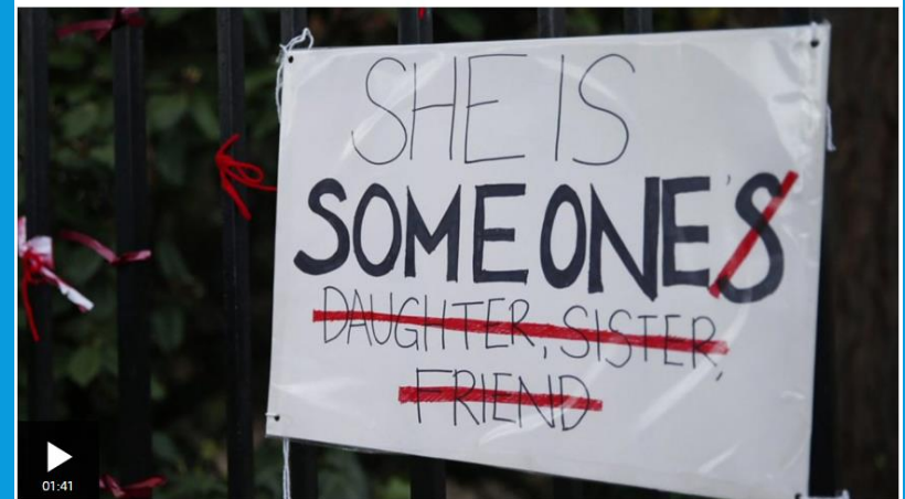
Tackling sexual abuse in schools through the arts